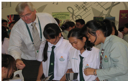
Visiting students, 2008 New Zealand Education Fairs in Thailand.

Industry Levy funding is supporting this event.